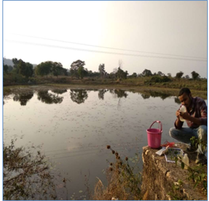
Water Bodies in Ratanpur Nagar Panchayat