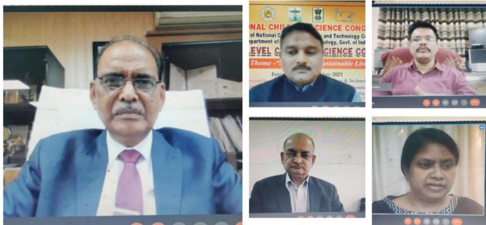
National Children Science Congress-2021