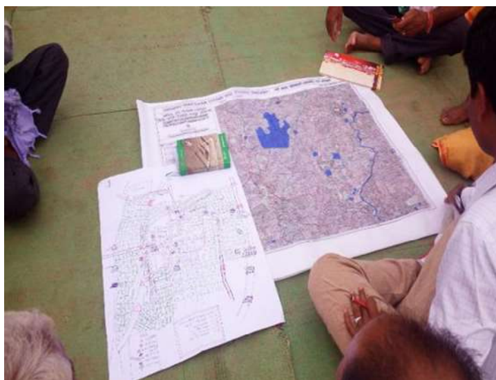
Field Validation of Action plan