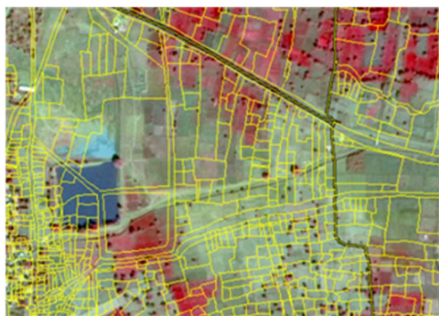
1:50,000 scale geo-referenced cadastral data on 10,000 scale satellite data

The Project was under taken in to extend technical support to the Revenue and Land Records Department for transforming the Cadastral data of entire State on 1:10,000 scale and create enabling environment for the Revenue and Land Records Department and other development departments who require georeferenced cadastral data for preparation of DPR and local level development plans.